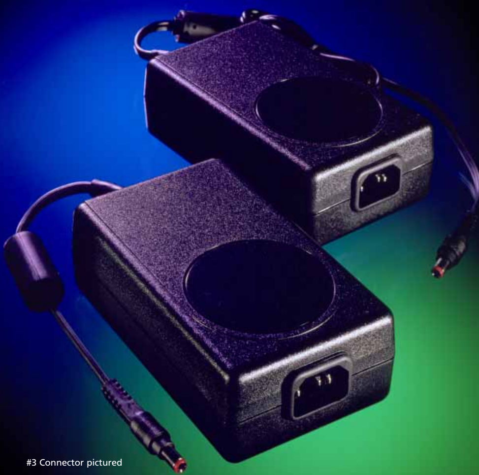
#3 Connector pictured